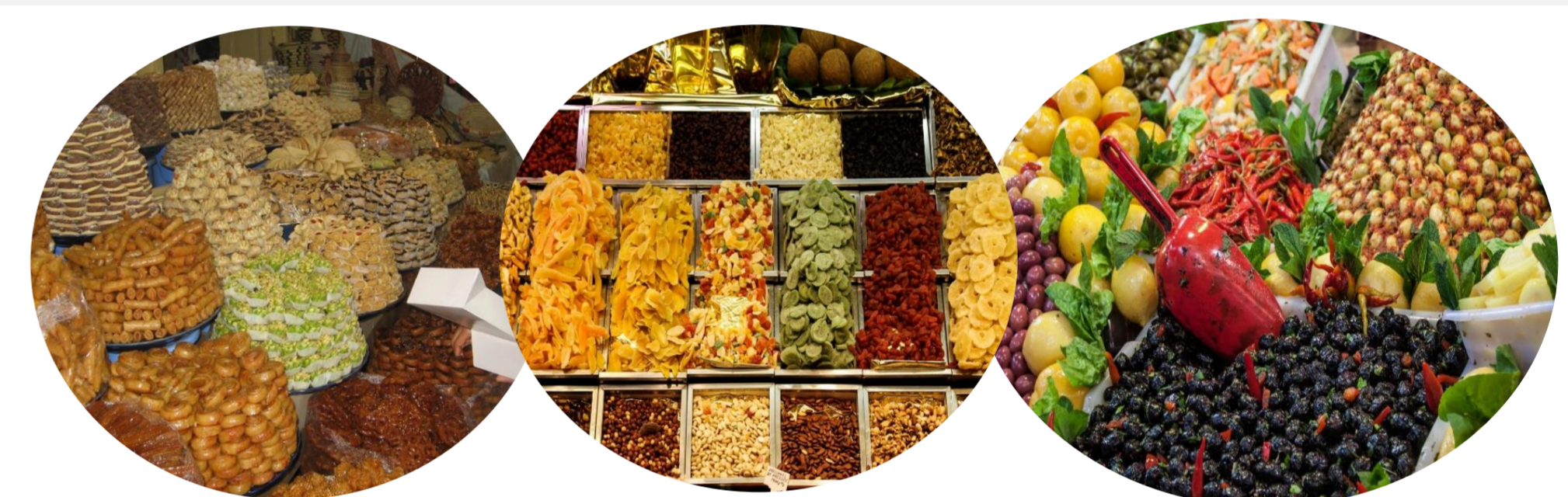
Food Data included in National datasets within FoodExplorer.