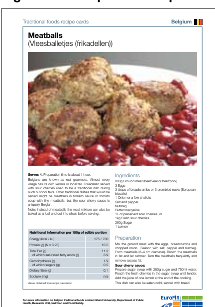
Figure 1: Examples of recipe cards

The recipe cards are available in English and in the official language of the country of origin.