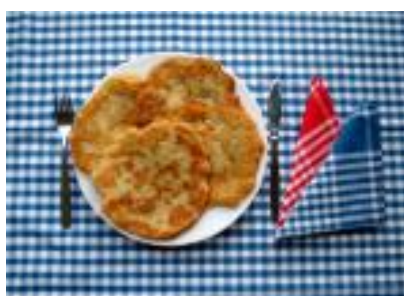
Traditional Czech Bramborak dish

Input: Recipe and ingredients information was taken from previous study 2 . Targets were set to improve saturated fatty acids (<4g/100g), sodium (<360mg), fiber (>2.1g/100g) and proteins (>12% E) contents simultaneously while keeping acceptable proportions in amounts of milk, flour and eggs (same as in initial recipe)